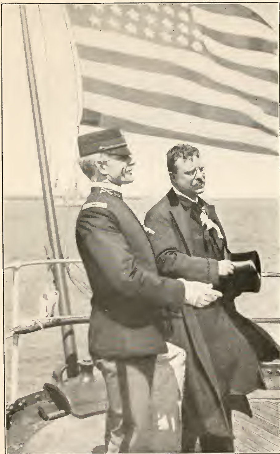
ROOSEVELT ON BOARD U. S. S. ALGONQUIN, CHARLESTON, S. C.